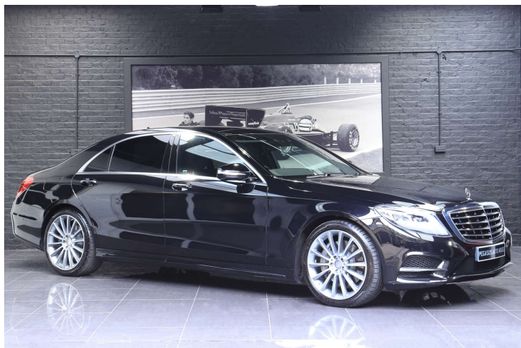
MERCEDES-BENZ S CLASS S350DL AMG LINE EXECUTIVE